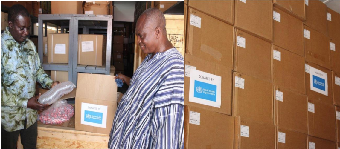
Laboratory Supplies and equipment handed over the head of Public Health Reference Laboratory, Ghana Health Services.