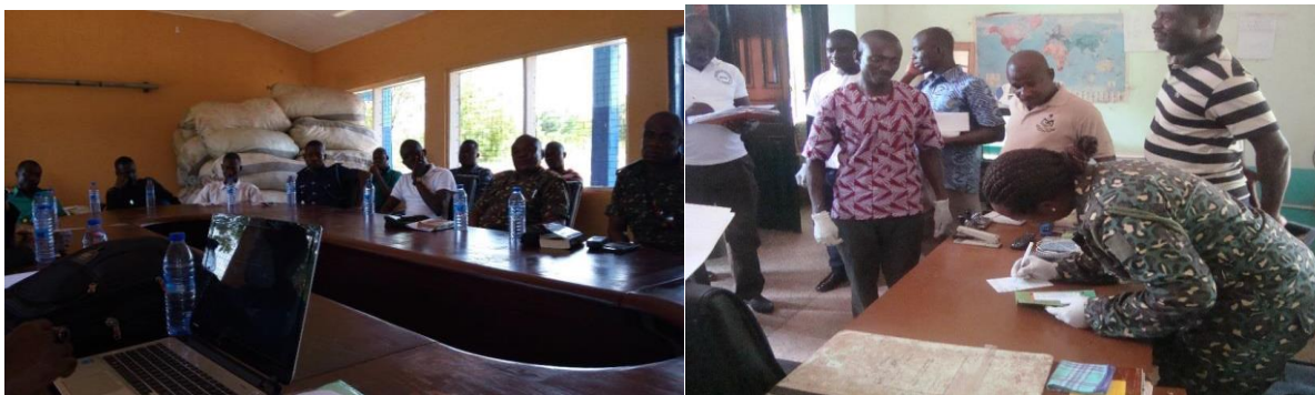
POE simulation exercise activities involving Immigration officers and other staff in Tatala and Hamile