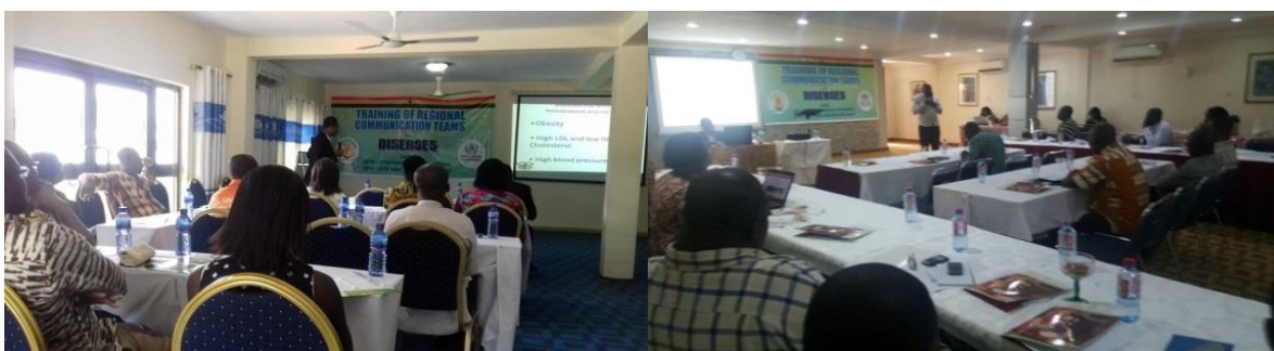
Participants in the risk communication and social mobilization training