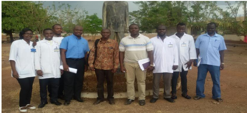
The international epidemiologist with GHS team members during the meningitis outbreak investigation and response intervention in Sampa, Brong Ahafo