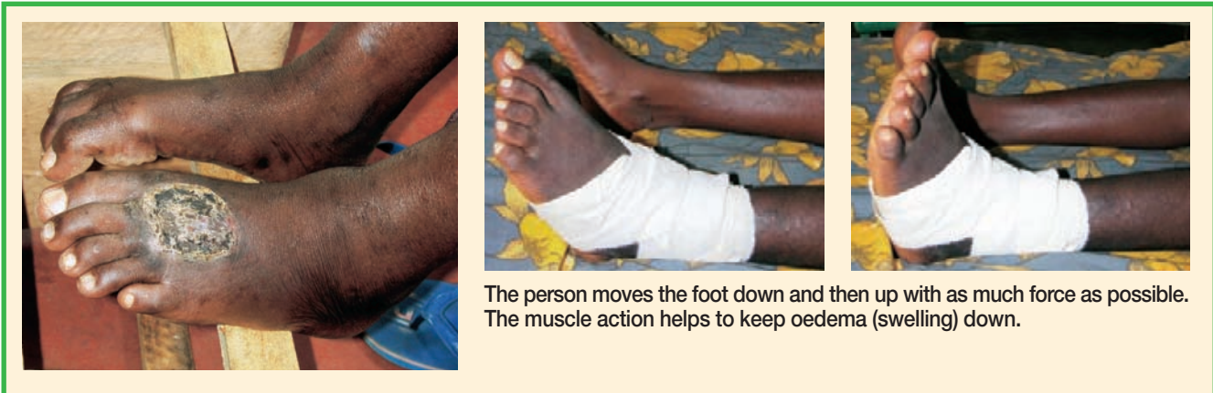
Figure 5.3.5 Movement to reduce oedema in the legs and feet