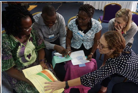
A view of some participants during group work