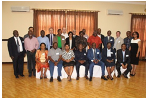
2 nd meetings of the Technical Coordinating Committee and Steering Committee of the African Vaccine Regulatory Forum (AVAREF), 20-24 February 2017, Zanzibar, United Republic of Tanzania