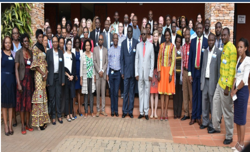
Group picture of participants at the workshop on Home Based Records, Munyonyo, Kampala: 21-24 February 2017