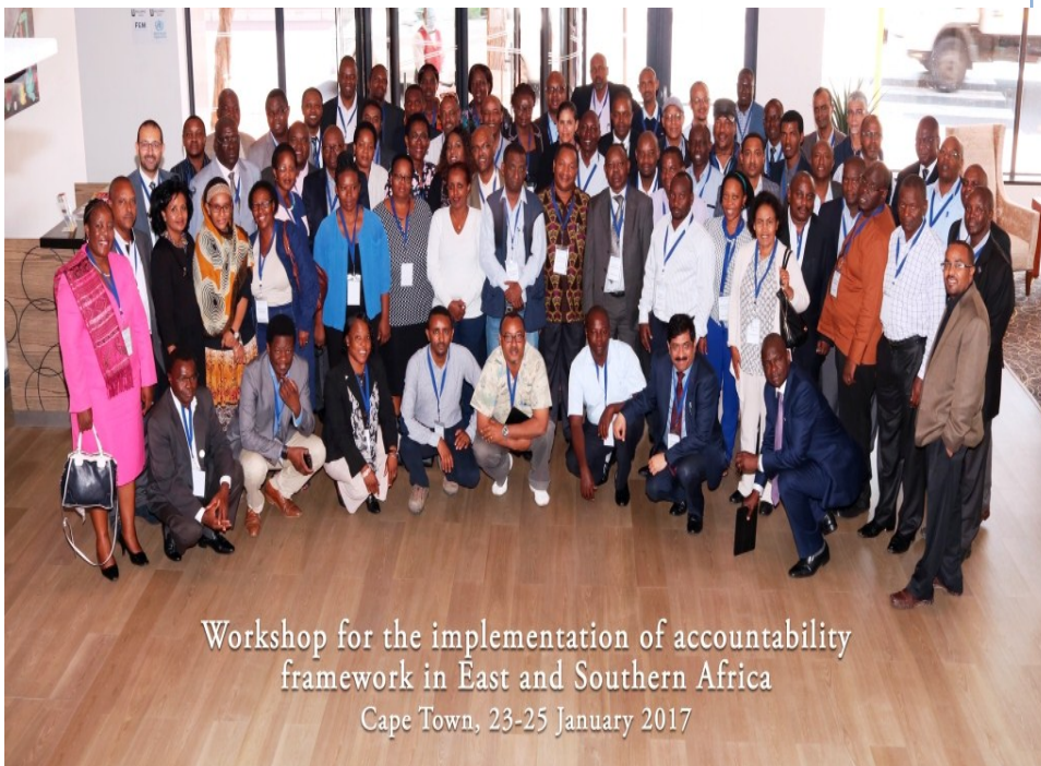
Workshop for the implementation of accountability framework in East and Southern Africa Cape Town, 23-25 January 2017