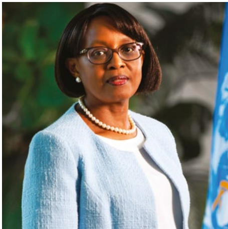
Dr Matshidiso Moeti