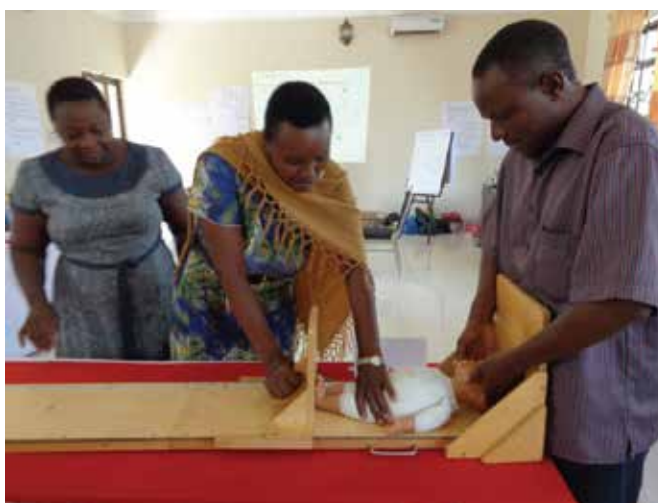
Practicing to measure the height of an infant

Through the ANI project, the training on surveillance was linked to other training