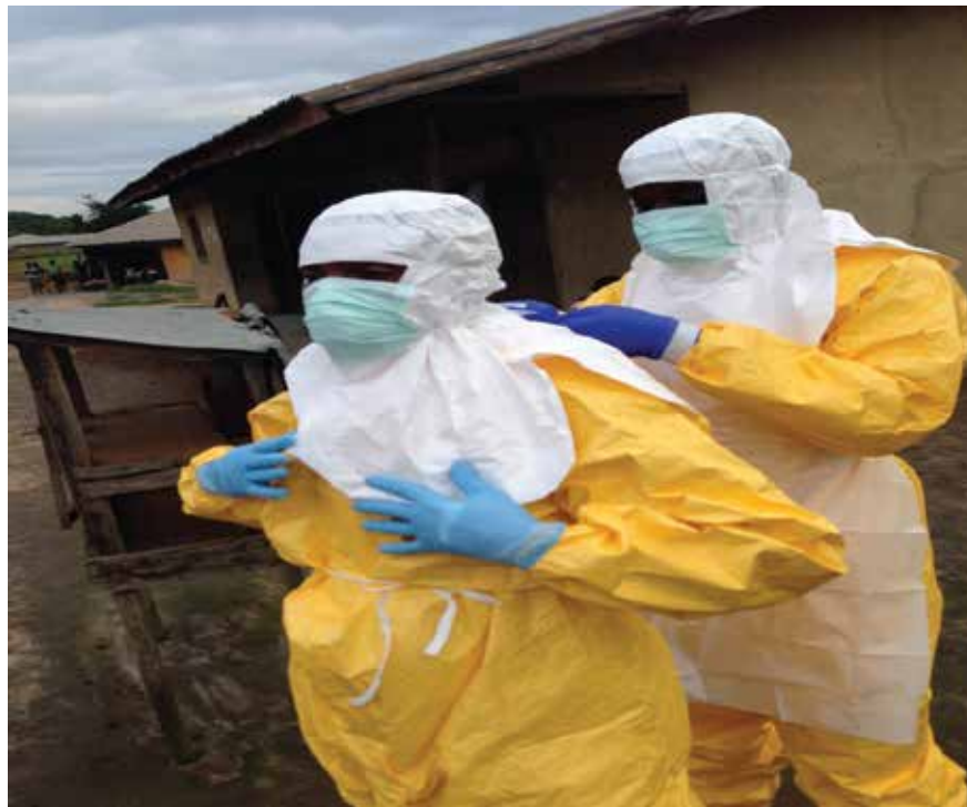
Health workers helping each other wear Personal Protective gear.

Recommendations provided during the dissemination meeting resulted into development of a comprehensive national occupational health and safety action plan for health care workers. This is a tool that will guide the country in protecting and promoting the health and safety of the health care workers.