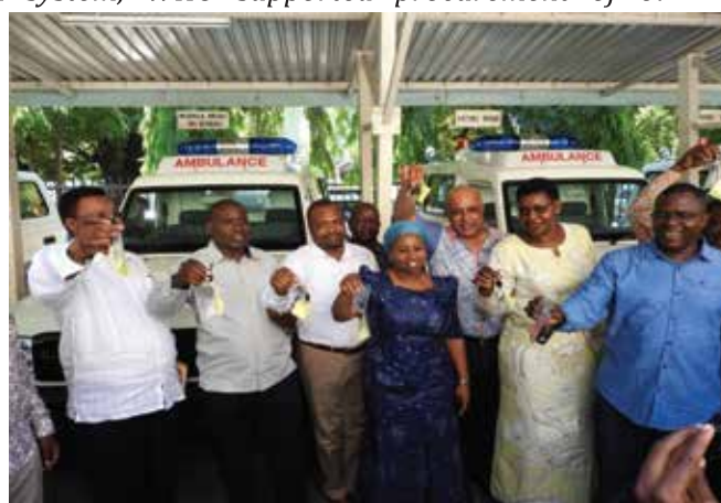
Delivery of Ambulances (Hon. Minister of Health at the