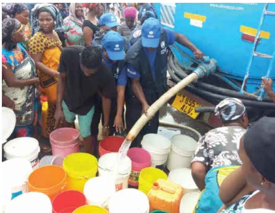
WHO staff providing clean water to affected community during the Cholera outbreak

2. Training of 186 Environmental Health Officers and district water technicians from 11 regions (10 from Tanzania mainland and one from Zanzibar), on testing equipment operation, methods of testing, testing water