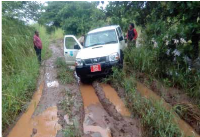
Switch implementation coincided with heavy rains making some roads impassable.

The year 2016 witnessed a major public health event when Tanzania joined the rest of the world in switching to a new polio vaccine as part of a final push to eradicate polio. The switch happened from the trivalent oral polio vaccine (tOPV) which protects against all three strains of wild polio virus and switch to bivalent OPV (bOPV), which protects against only two wild polio strains—types 1 and 3. The older version of the vaccine (tOPV) contains a strain of the polio virus, type 2, which has been eradicated and no longer needs to be introduced to children.