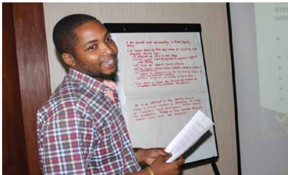
A journalism fellow sharing his work during the training session