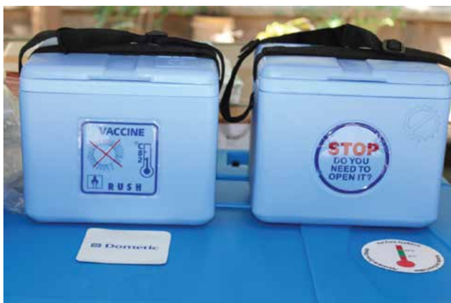
Vaccine carriers used during routine and supplementary immunization campaigns.

The consensus reached at the end was to review the national comprehensive Polio response plan, and conduct another simulation exercise before the end of the year. It is worth noting that the proposed simulation was postponed till the following year due to some constraints.