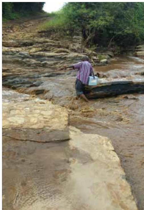
A health worker traversing a flooded river to deliver vaccine to a health facility

To make sure that the switch went smoothly as planned, independent monitors visited health facilities to check that the defunct trivalent oral polio vaccine was no longer in use, and the bivalent oral polio vaccine is used instead. The involvement of all stakeholders at all levels; including commitment of the government and appropriate implementation plans being in place were key to the success. The undertaking was a major milestone for Tanzania and in line with the Global Polio Eradication Initiative Polio Eradication and Endgame Strategic Plan 2013–2018.