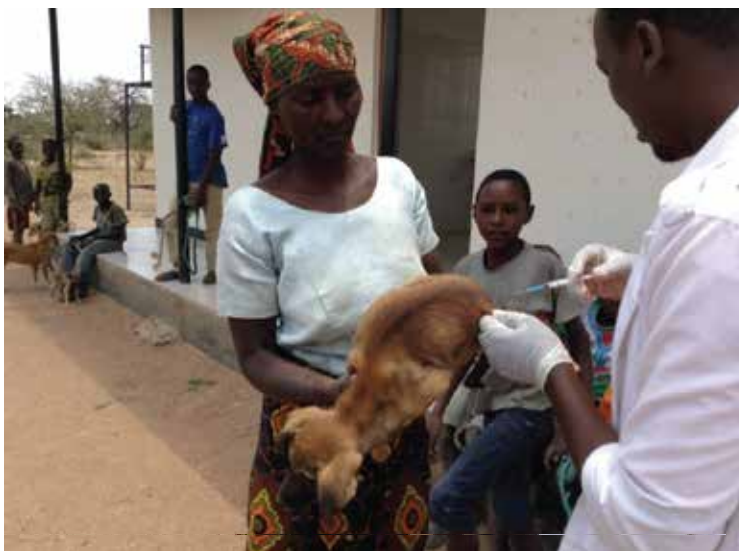
A dog receiving antirabies vaccine.

It is worth noting that Tanzania is among the three countries in the world implementing a five-year rabies elimination demonstration project through a grant from the WHO/Bill and Melinda Gates Foundation. Implementation is through the Ministry of Agriculture, Livestock Development and Fisheries and the Ministry of Health, Community Development, Gender, Elderly and Children.