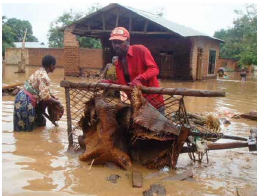
A household rescuing its belongings from floods due to heavy rains.

Through support from the Norwegian Ministry of Foreign Affairs, Climate and Health, training package was developed and 20 Regional Health Officers and Regional IDSR Focal Persons were trained on the use of climate information and products for health planning as part of the implementation of the Global Framework for Climate Services Project. A policy brief on Climate and Health was also developed feeding into the review of the Health Policy.