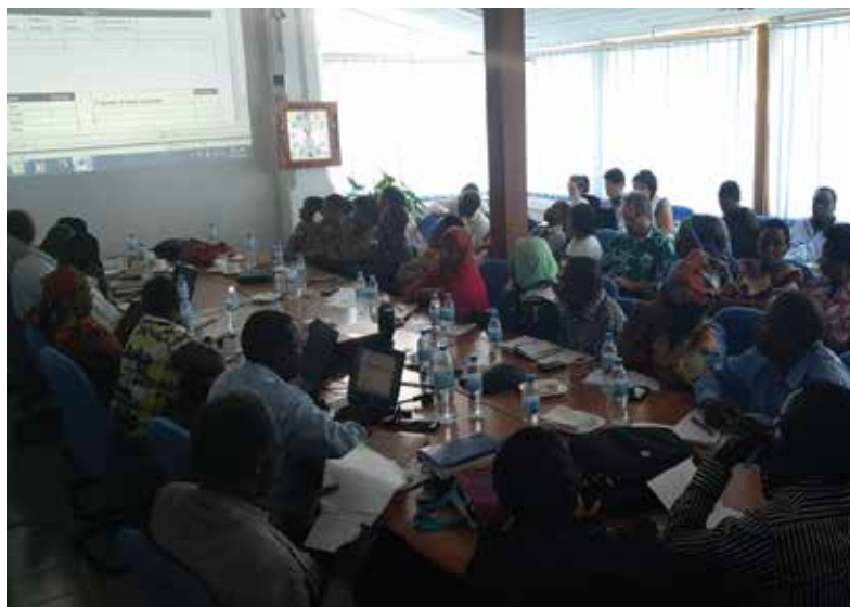
Pix 5: Partners in a coordination meeting

4. Buffer stocks of Emergency supplies: Having stock of emergency supplies to respond to Health emergencies is as important as having buffer funds to respond. Buffer stocks reduce delays from tendering and ordering supplies especially from offshore.