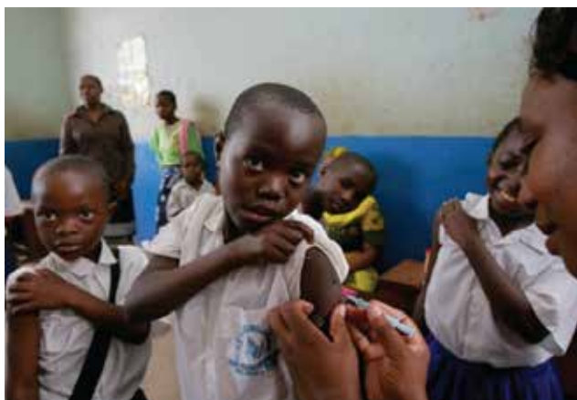
A girl receiving a dose of HPV in Kilimanjaro

Although a major cost item is the vaccine, due attention should be paid to operational costs which are often dependent on the delivery mode. Equally important is the need to review the readiness, capacity and capability of the system to normally and routinely deliver services. This project was funded by the GAVI with collaborative support of PATH and WHO to the Government of Tanzania in the of the project span.