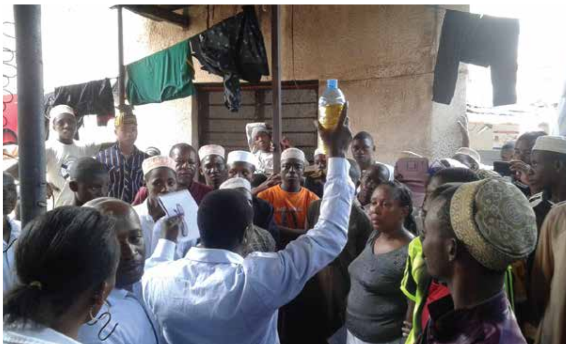
Community sensitization on ORS use during Cholera outbreak response

CHWs were instrumental in distributing water purification materials (water guard) to all households and promoting preventive measures such as hand washing at a community level. The trained CHWs managed to reach 845 House Holds (HH) out of 1200 in the affected wards with information on cholera disease and water guards for HH water treatment. After 5 days of intensive field activity, the number of cholera cases declined significantly and the district reported no new case of cholera.