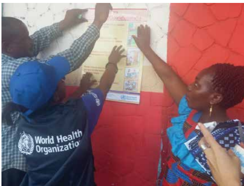
Community mobilizers posting IEC material on Cholera

While knowledge on cholera prevention and control was found to be deficient and coloured by traditional attitudes and beliefs, some communities organized themselves to respond to the cholera outbreak with support of organizations active on the ground. Results of this assessment were useful for strategic communication and social mobilization at community level geared to end the Cholera outbreak.