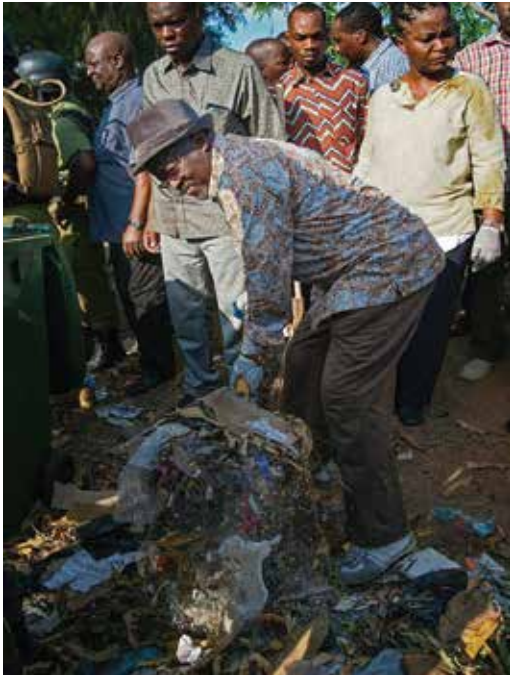
Pix 1: President John Magufuli setting the example by collecting rubbish during the National Independence Day

To achieve effective outbreak response and containment, strong leadership is key to facilitate smooth coordination of response activities by the different sectors