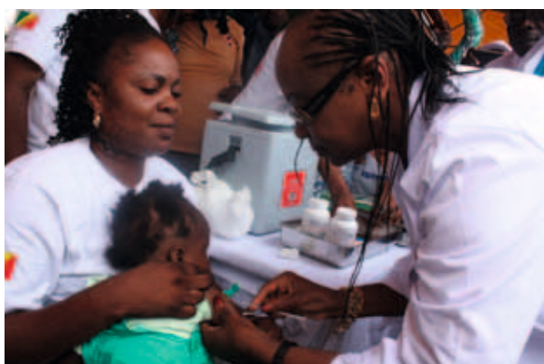
WHO representative in Congo administering a vaccine at the launch event in Pointe Noire, Congo