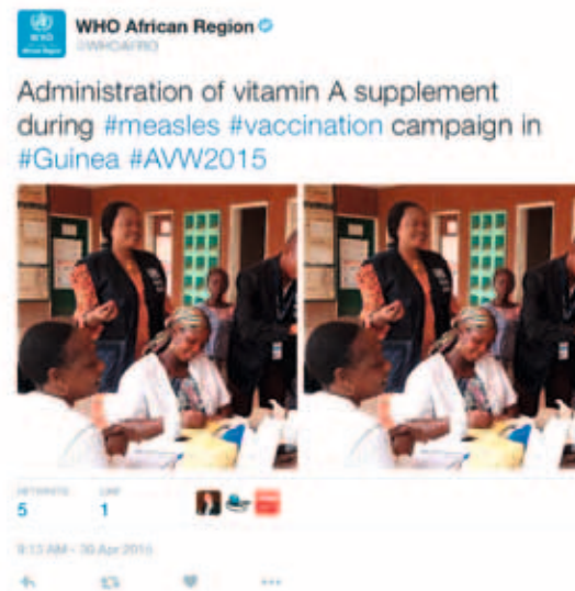
Vitamin A supplementation, one of the key health interventions offered during AVW