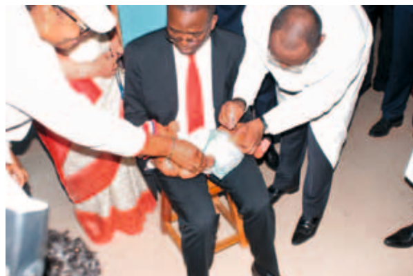
Prime Minister carrying the baby receiving IPV administered by the MOH