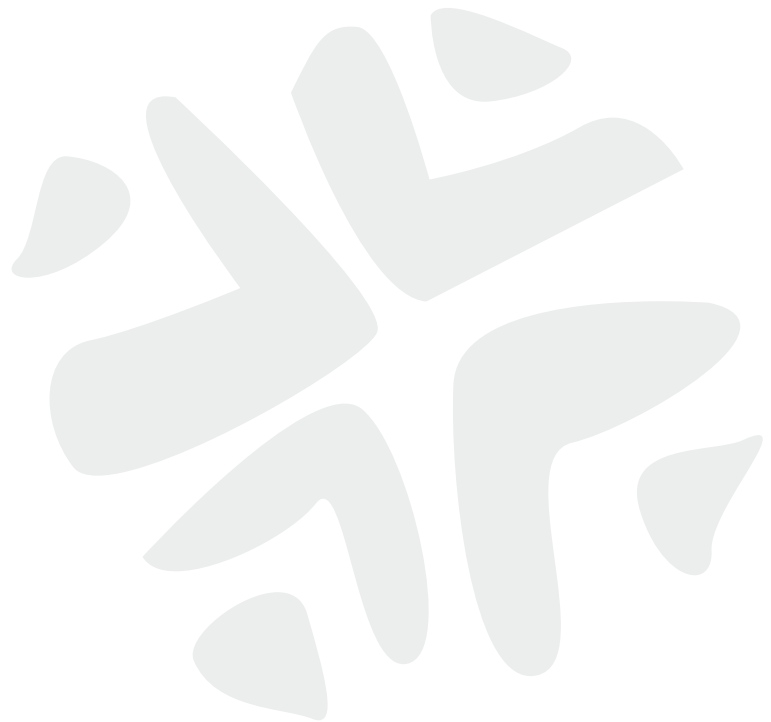
WHO Uganda and Ministry of Health Uganda actively participated in the social media campaign using Twitter

UNICEF Uganda, Ministry of Health UG, UG in Uganda and 2 others