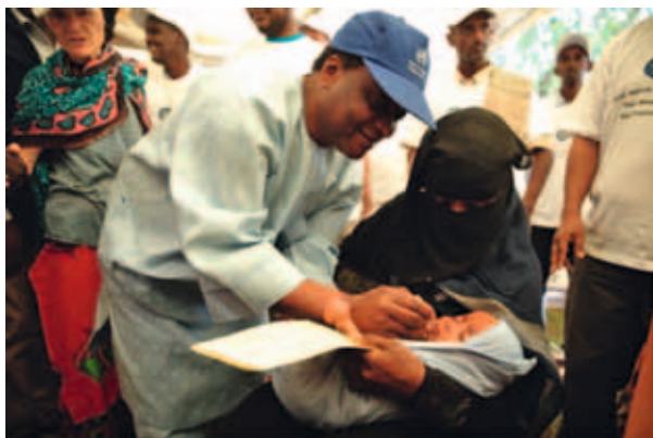
Dr. Pierre MPELE-KILEBOU, WHO Representative in Ethiopia vaccinating a child during AVW launch in Afar region

The 5th annual African Vaccination Week was launched in Ethiopia on 21 April 2015 with a media briefing and vaccination messages, nationally as well as in the regions, to intensify vaccination activities for the protection of children against diseases.