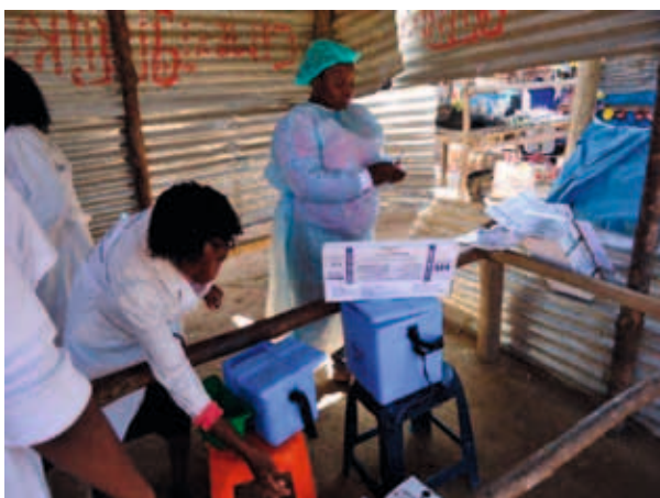
A View of a team conducting outreach immunization activities during AVW 2015

The AVW 2015 was launched on 24 April 2015. The opportunity was used to expand awareness and social commitment towards vaccination and the benefits of immunization. The country carried out activities in 32 priority municipalities in the 18 provinces in the country. Activities aimed to strengthen social mobilization efforts and public awareness campaigns to reach a targeted 479,796 children and mothers with life-saving vaccines.