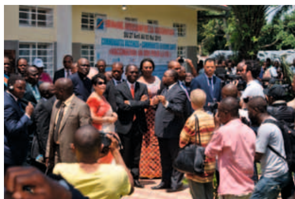
PM with GAVI CEO listening to the MOH at launch of event in front of new health centre