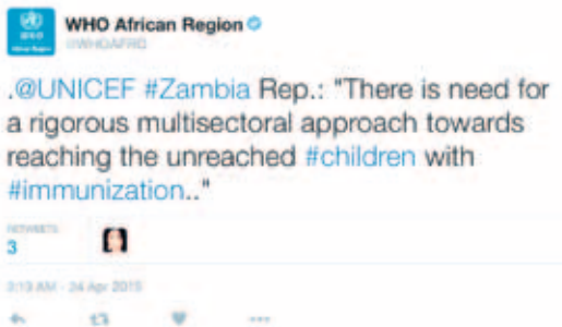
AVW activities were organised in close collaboration with UNICEF and partners