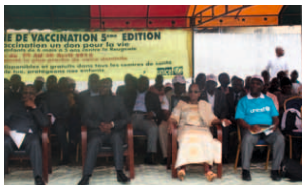
A view of the of the audience at the launching event in Pointe Noire, Congo