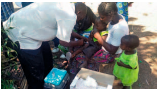
A health worker vaccinating a child during outreach strategy

Malawi celebrated AVW 2015 from 24 to 30 April 2015. Activities conducted included mobilization and sensitization campaigns with dissemination of messages (through health talks, radio, newspaper and television) to the general public on the importance of immunizing children against childhood illnesses and the value of immunization. There was also catch up immunization activities.