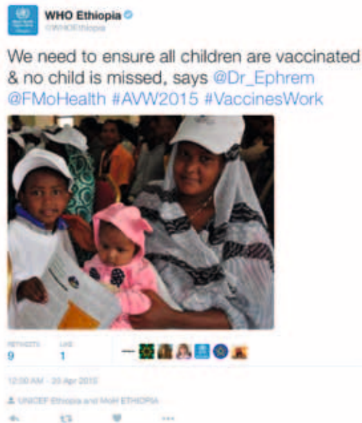
WHO Ethiopia was actively engaged in the campaign on the ground and online using social media