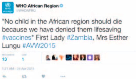
The first lady of Zambia launched AVW in Lusaka. This was the Regional launch