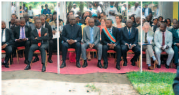
A view of the of the audience at the launching event in in DRC

DRC has been polio-free since the end of 2011 but it was among the worst affected countries worldwide for many years. The year before DRC was declared polio-free, 93 AFP cases were recorded. The challenge now for the country is a weak health system necessitating increased routine immunization coverage against other diseases.