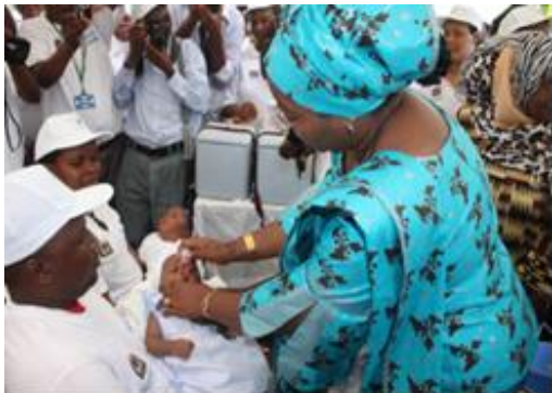
The First Lady of the United Republic of Tanzania vaccinating a child against polio during the AVW launch