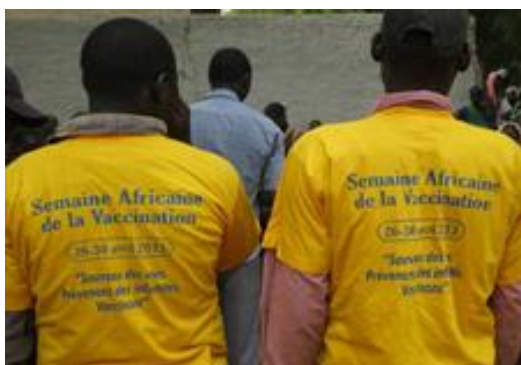
T-shirts made for the AVW campaign in Cameroon

In Cameroon, innovative efforts were made to improve public awareness regarding the importance and success of national immunization programmes. A national You-tube spot for the campaign, starring footballer Roger Milla, was produced and disseminated on the web, a second You-tube spot was produced on Routine Immunization and broadcasted immediately after the AVW. Umbrellas, T-shirts and banners were also produced with AVW messages.