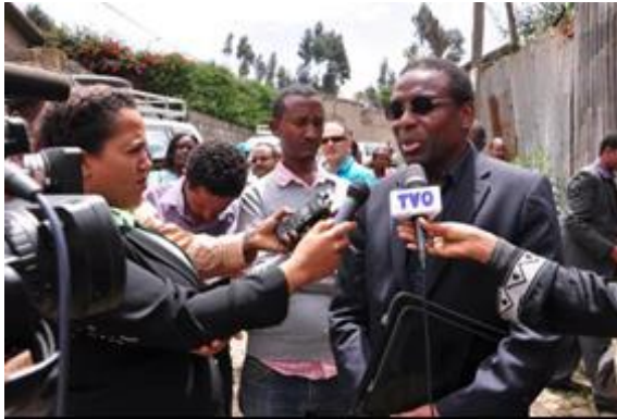
Dr Luis G. Sambo, WHO Regional Director for Africa, being interviewed on the occasion of the African Vaccination Week in Ethiopia.

On 31 April 2013, the WHO Regional Director for Africa, Dr Luis G. Sambo, joined in solidarity, as he attended the AVW closing event in Selam Health Centre at Asalla, Ethiopia. Other participants included the Ethiopian Federal Minister of Health (FMOH), WHO and UNICEF Country Representatives to Ethiopia, Deputy Head of Addis Ababa City Administration Health Bureau, WHO and UNICEF staff, several mothers with their children, health workers and other participants.