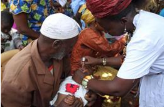
A father having his child vaccinated against polio in Guinea.