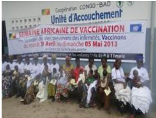
Women waiting to have their babies vaccinated at the launch of the AVW in Brazzaville, Congo.