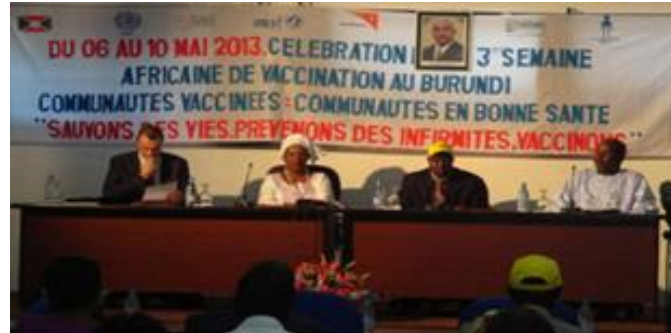
A press conference to formally launch the AVW in Bujumbura, Burundi.