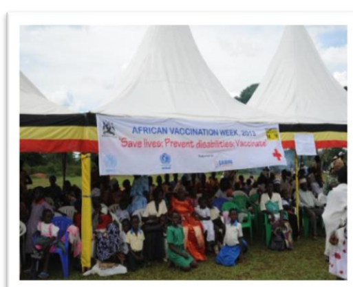
Mothers with their children at the launch of the new conjugate vaccine against pneumonia (PCV10) seated under a banner announcing the theme for the AVW.

Throughout the Region, multiple national AVW launching events occurred in cities, towns and remote villages, in almost all the countries (43 in total). These events were graced by both high-level authorities and local leaders, and also served to raise the profile of immunization and underscore the importance of immunization to the participating communities and media outlets. All the events were captured and are available at ‘daily updates’ on the WHO/AFRO webpage. Some countries took advantage of the platform created by the African Vaccination Week to integrate other health interventions together with their vaccination campaigns, such as vitamin A supplementation, deworming treatment, provision of ITNs, ORS, Zinc tablets, iron and folate tablets, wash kits and various screening procedures.