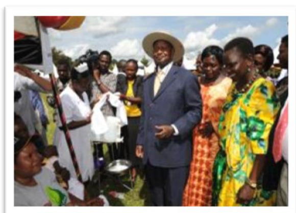
President of Uganda, H.E. Yoweri Museveni, is being presented a baby immunized by the new PCV10 during the launch of the third AVW.