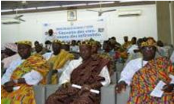
Traditional leaders attending the launch in Togo, underscoring the importance and role of engagement of community leaders during the AVW.

programme on the importance of immunization in disease prevention was developed and reproduced on CD for use in schools. Several communication materials were produced to spread the vaccination-related messages: print media, television, radio and public service announcements to spread its vaccination-related messages.