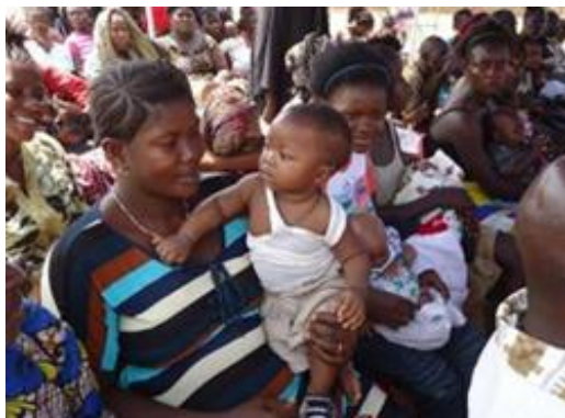
Mothers waiting anxiously to have their babies vaccinated during a polio campaign, as part of the launch of the AVW in Freetown, Sierra Leone.