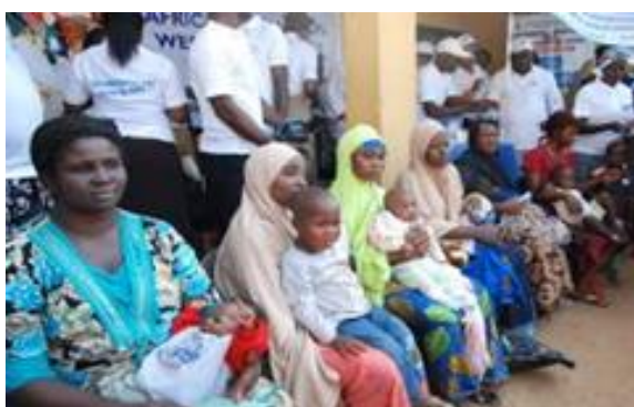
Mothers and children waiting to be vaccinated at the designated centres in Nigeria.

Nigeria integrated her Maternal, New Born and Child Health Week (MNCHW) with the African Vaccination Week. MNCHW is a bi-annual event which provides the opportunity for child vaccination, community education and sensitization on important maternal and child health best practices. Delivering Tetanus Toxoid (TT) to eligible women of reproductive age and vaccinating children (0-11 months) according to the national policy were some of the specific objectives laid out for this year's AVW/MNCHW.