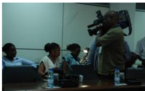
A media conference to provide information about the activities for the AVW.

A press conference was organized to provide the national media with information on AVW activities and Routine Immunization data. The conference comprised four sessions organized for different news channels.