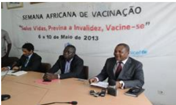
From left to right: The UNICEF Representative, the Minister of Health and the WHO Representative in Guinea Bissau, at the press conference.

On 6 May, a press conference was organized by the Minister of Health to inform the media on AVW activities in Guinea Bissau. The representatives of WHO and UNICEF flanked the Minister of Health at the press conference. The Minister clearly stated that immunization is the most cost effective health intervention and that the government and partners of Guinea Bissau are dedicated to improving health services, particularly immunization health services. He added that in this 3 rd AVW, catch-up activities will be held in an outreach mode, improving vaccination coverage for all vaccines to at least 80%.