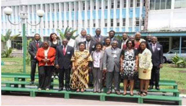
Group picture of participants at the informal consultation meeting for the preparations towards the 3 rd edition of the African Vaccination Week. 07-08 February 2013. Brazzaville, Congo.