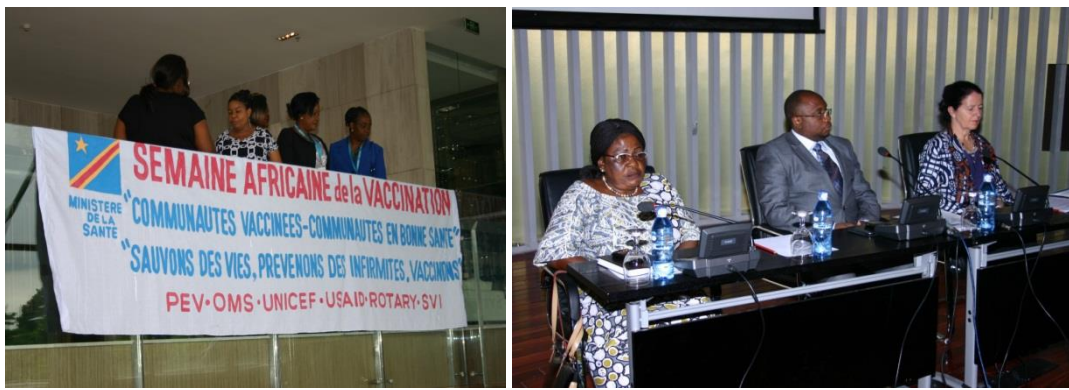
A press conference chaired by the Ministry of Health with the participation of partners, to explain the activities planned for the AVW in DRC.

A press conference was organized to officially launch the AVW on 22 April 2013