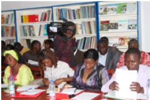
Press conference for the all the media (radio, print, television) to announce the activities planned for AVW in Cameroon.

As part of advocacy activities, the country organized a press conference to announce the AVW and involve key media outlets of the country in the promotion of the health benefits of vaccination. This goal was attained successfully, since 33 journalists of the written, online and audio-visual media were present. At the end of the press conference, the journalists had the opportunity to visit the offices of the 'Expanded Programme on Vaccination' as well as the vaccine warehouse.