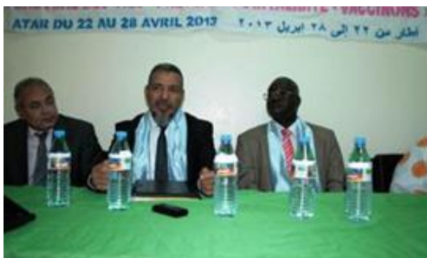
The Secretary General of the Ministry of Health of Mauritania opening the media briefing for the AVW.

The country engaged strongly in AVW advocacy activities to carry immunization messages forward. A media briefing was organized to offer journalists and other media outlets the opportunity to learn about the AVW so that they would be able to report on this year's edition. Moreover, a quiz on routine vaccination was developed with the support of "Réseau des Journalistes Amis de la vaccination" (REJAV) and broadcast on national radio stations. A sketch on vaccination was also developed, starring local actors and posted on the internet.