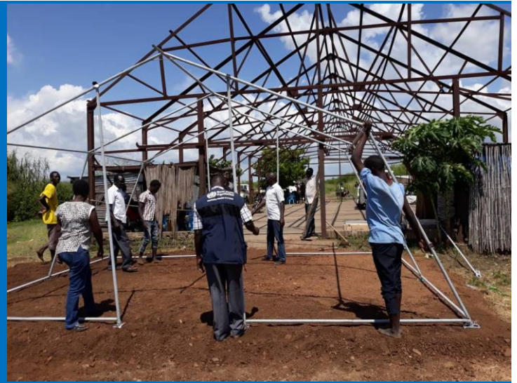
A screening site being set up in Nimule River Port, Torit State.

Humanitarian Situation Report Issue # 35 17 - 23 SEPTEMBER 2018