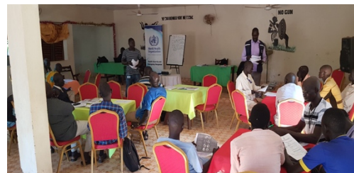
IDSR training held from 29 th Oct to 2 nd Nov 2018 in Rumbek.