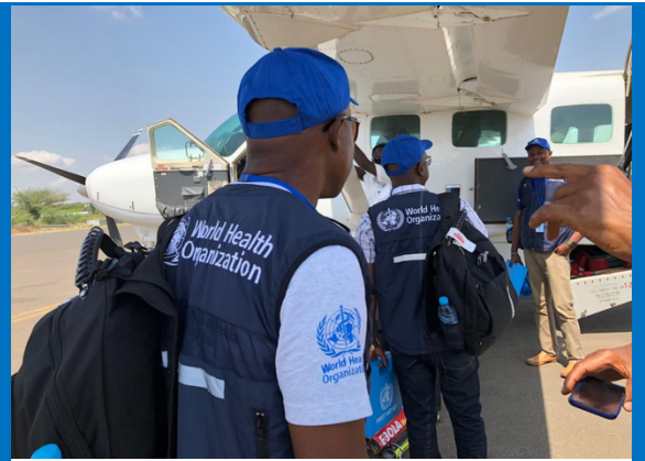
Deployment of WHO International Consultants to Yei, Nimule and Yambio to support EVD Preparedness.