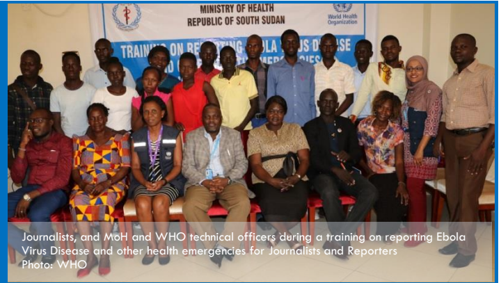
Journalists, and MoH and WHO technical officers during a training on reporting Ebola Virus Disease and other health emergencies for Journalists and Reporters

Humanitarian Situation Report Issue # 44 19 - 25 NOVEMBER, 2018