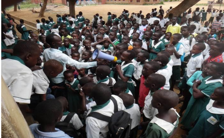
Sensitization of school children.