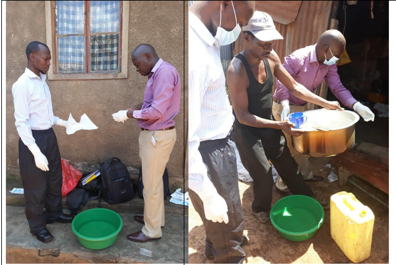
Makindye Division Team at the scene of the community death at Katwe II Musoke Zone