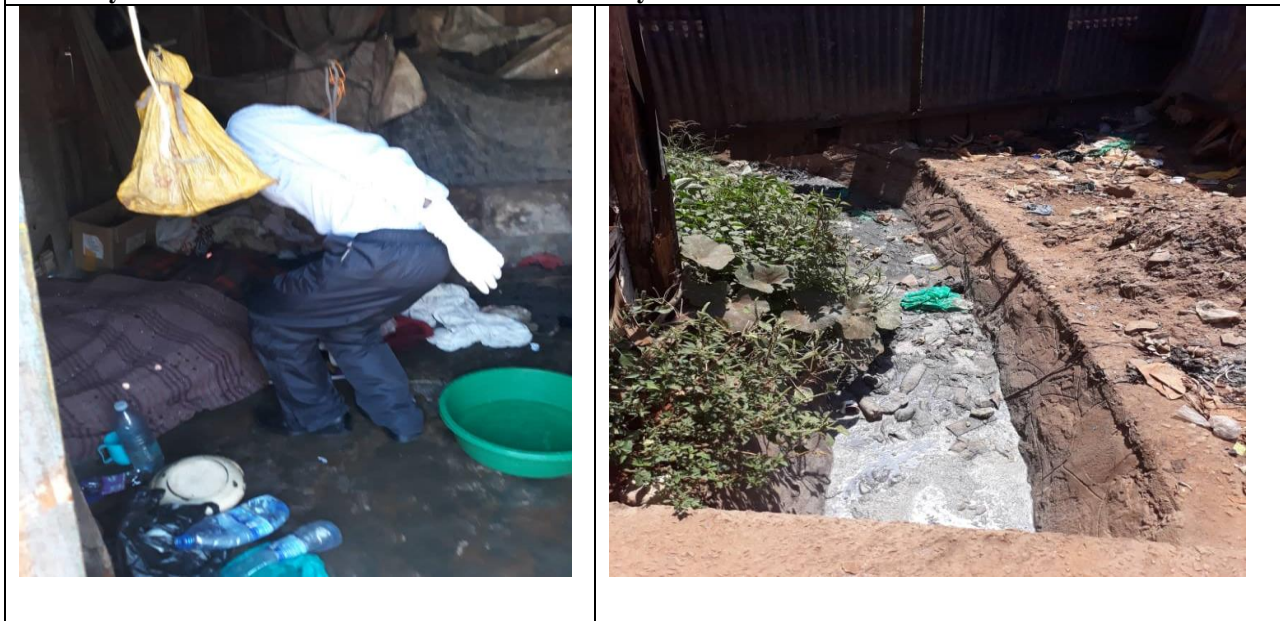
Table 2: Cholera Outbreak Situation pictorial – 3 rd February 2019