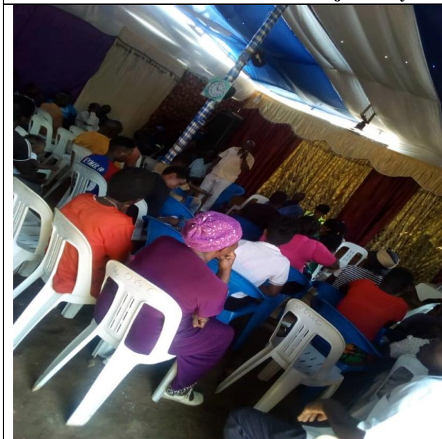
Bazara held at Katogo Zone, Makindye Division.