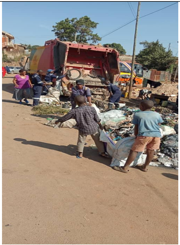
Central Division Team joined by the UPDF for a cleanup in Mengo Parish