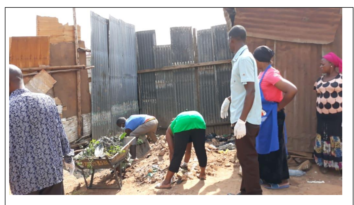
Table 1: Cholera Outbreak Situation pictorial – 6^{th} February 2019