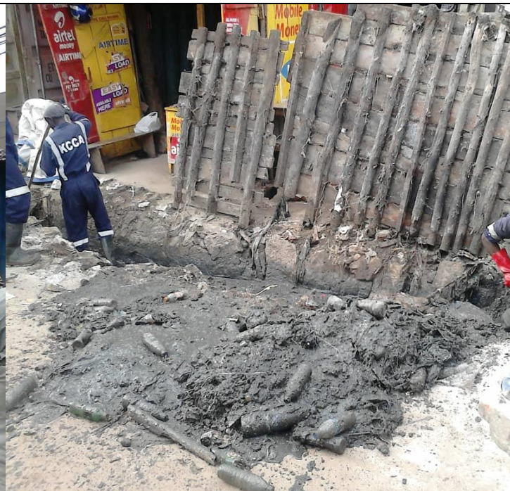
Clean ups in Kiganda Zone, Kisenyi II Central Division