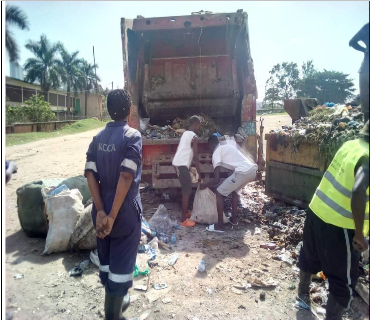
Clean ups in Bukesa Parish Central Division