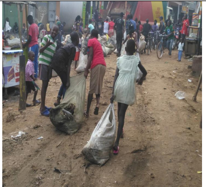
Clean ups in Kiganda and Ssebagala Zones in Kawempe Division