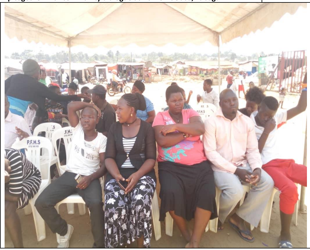
Community dialogue meeting during family planning outreach at Nsiike, Ndebba Lubaga