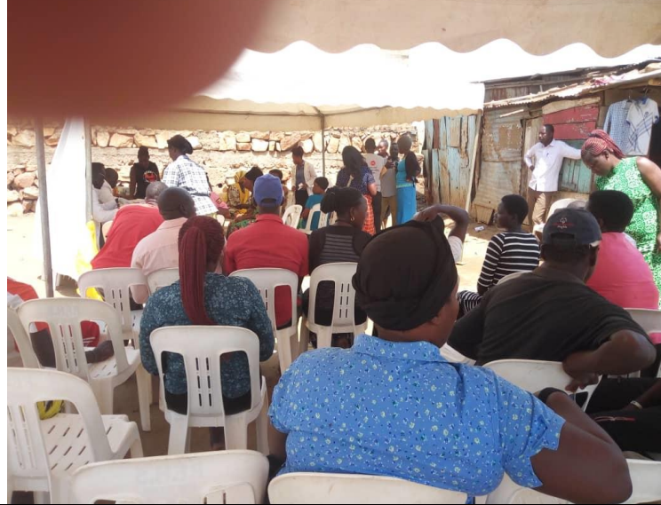
Integrated family planning camp together with community dialogue at Nsiike Ndebba, Lubaga