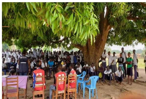
Engagement with Students at Yei Day Secondary School by SSRC and WHO