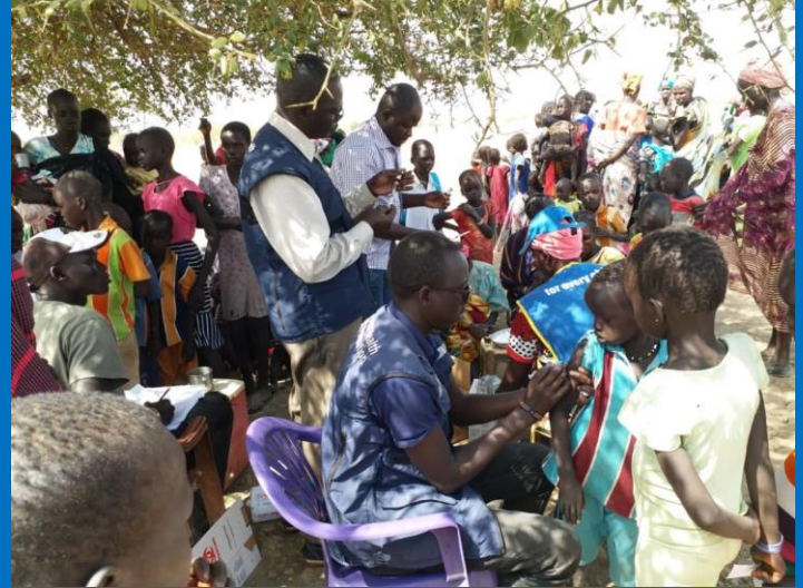
WHO and UNICEF providing support during the ongoing reactive measles vaccination in Mayom.