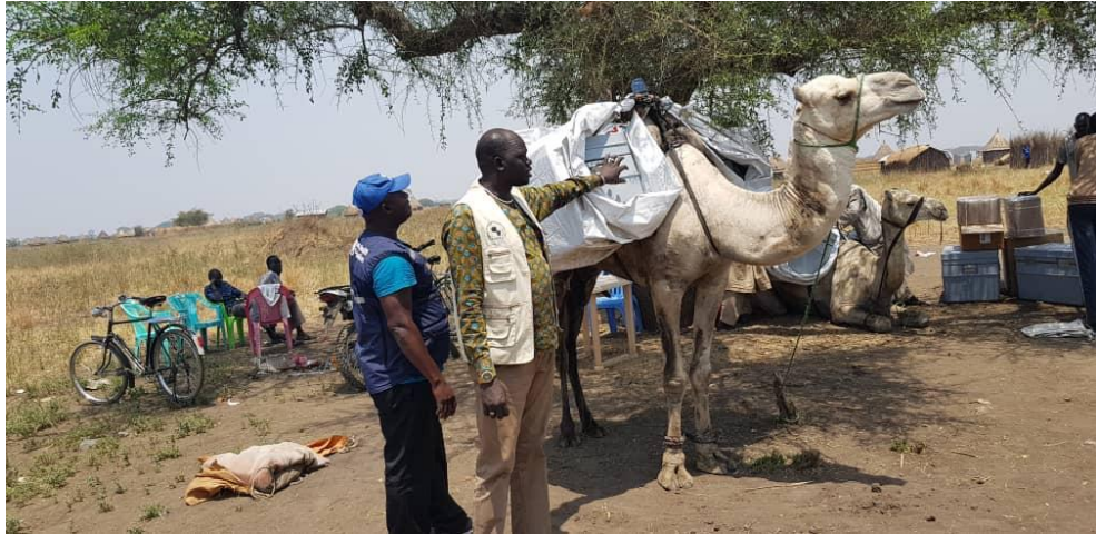
Innovative ways of distributing Sub Immunization Activities (SIA) supplies in Maiwut county.