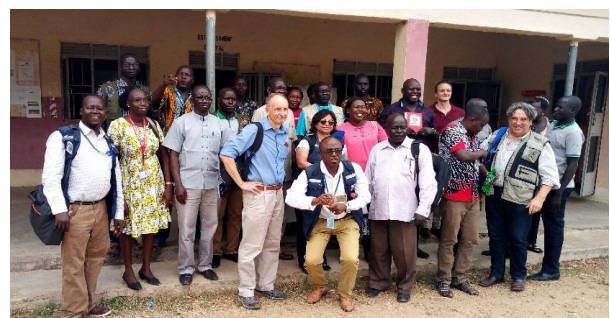
Group photo of the JMM team with the team in Nimule.