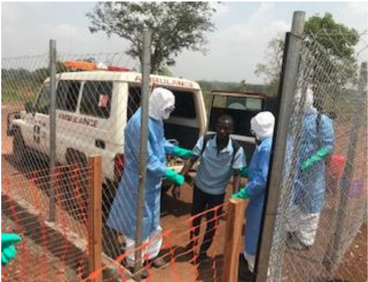
Picture showing practical session during the UNICEF WASH/IPC Training