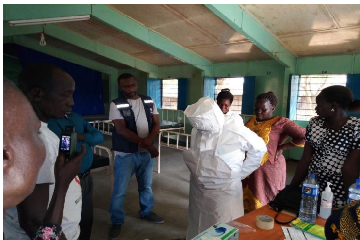
RRT simulation exercise in Nimule Hospital