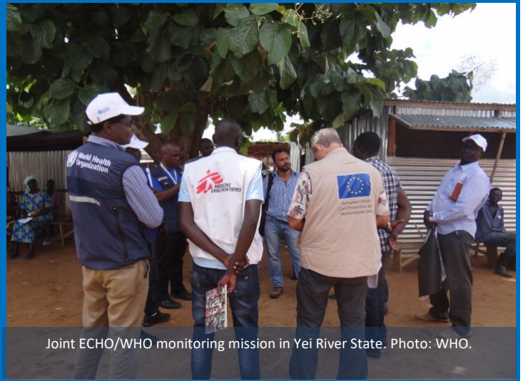
Joint ECHO/WHO monitoring mission in Yei River State.

Humanitarian Situation Report Issue # 21 Weeks 22 & 23 27 MAY – 9 JUNE 2019