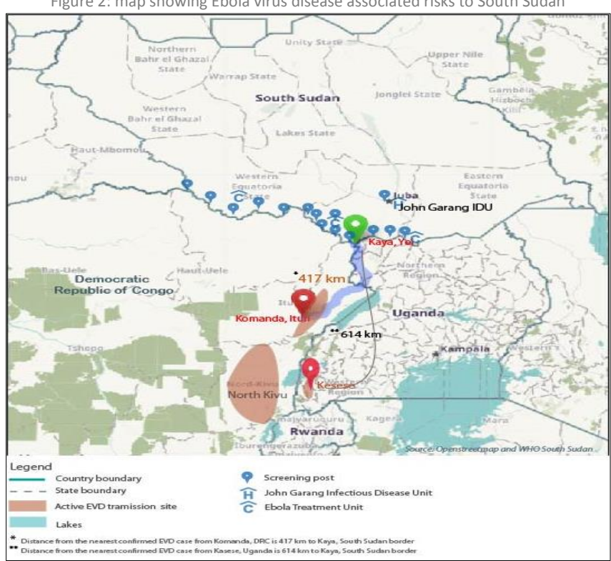
Figure 2: map showing Ebola virus disease associated risks to South Sudan