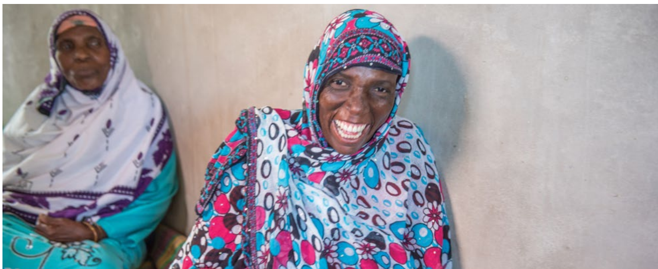
A woman during household contact screening by local community health volunteers in Tanzania