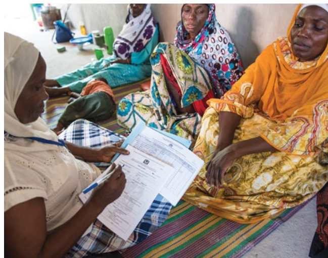
Mwanne completes the community referral form for a person with presumptive TB

At community level: data collection starts with the completion of a community TB screening form (TB12) by community health volunteers during TB screening activities. If the person screened has signs or symptoms of TB, community health volunteers also complete part I of the community referral form (TB15) and hand it to the person, who is then referred to the nearest TB health facility and instructed to hand the community referral form over to the facility staff. People with presumptive TB who have a community referral form are exempted from the fees for the general medical consultation.