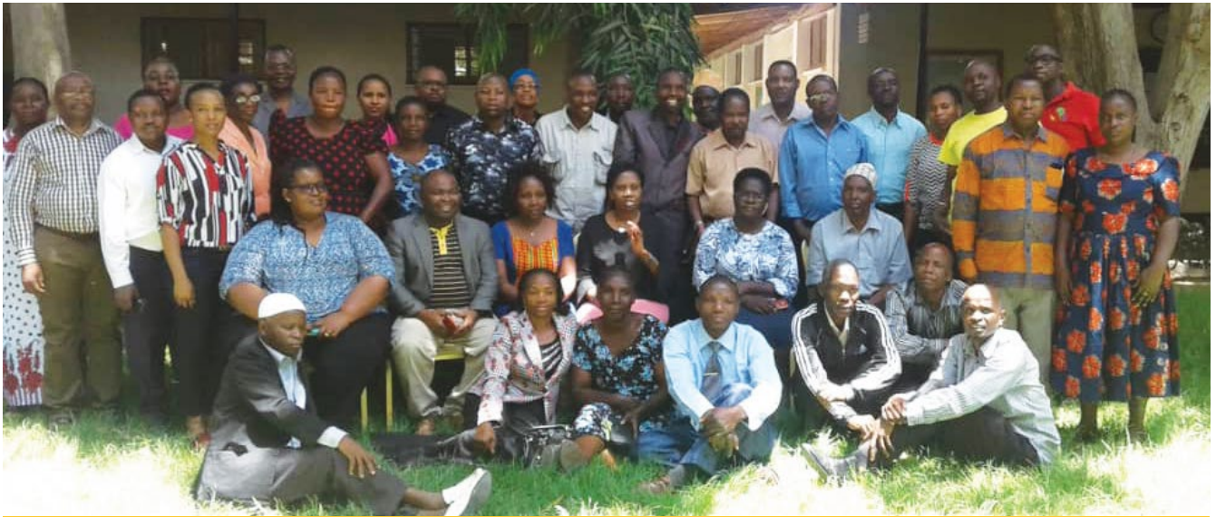
TTCN members during 2018 Annual General Meeting in Morogoro, Tanzania