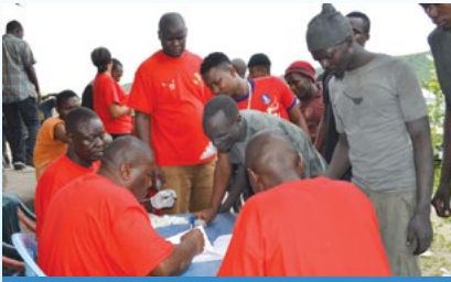
TB is curable, take action...