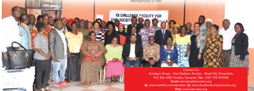
TB is curable, join us today to end TB in Tanzania