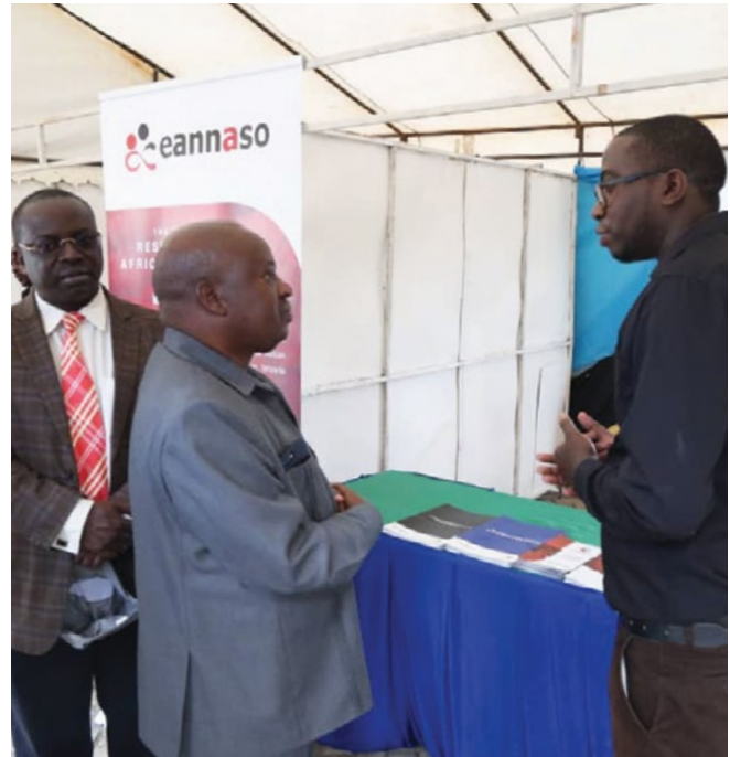
TTCN Secretary meeting the Honorable Speaker of the Tanzania Parliament

The results showed that, while communities were involved in the TB response, their activities were not coordinated and they did not speak with one voice. This was mainly due to the lack of a mechanism to enable the diverse and geographically widely located TB actors to engage formally with one another. On the basis of these findings, there was a recommendation to invest in a community platform to improve communication, coordination and networking and enable a more formal and harmonized engagement of all organizations already implementing community-based TB activities, thereby enhancing advocacy efforts, supporting the dissemination of good practices and improving service delivery outcomes.