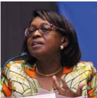
Dr Matshidiso Moeti WHO Regional Director for Africa