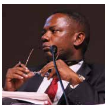
H.E. Dr Olavo Avelino Garcia Correia Deputy Prime Minister and Minister of Finance, Cabo Verde