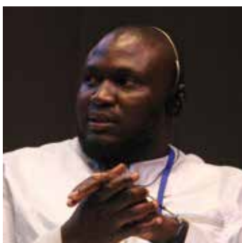
Hon. Toussaint Manga Youth parliamentarian