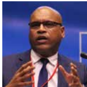
H.E. Dr Fernando Elisio Freire Minister of State, Parliamentary Affairs, President of the Council of Ministers and Minister of Sports, Cabo Verde