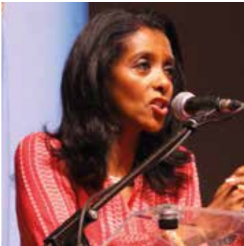
Ms Zeinab Badawi Moderator, International Broadcaster and Chair of the Royal African Society