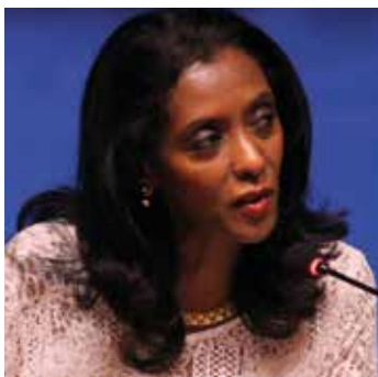
Ms Zeinab Badawi

International broadcaster and Chair of the Royal African Society