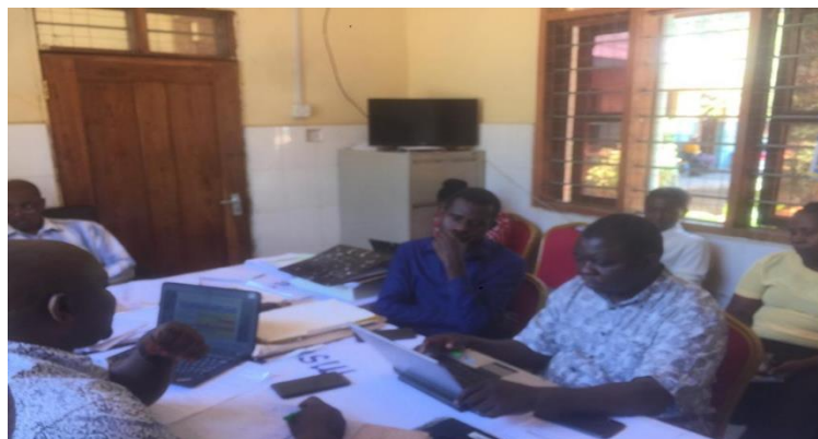
RHMT Member conduct meeting with CHMT during supportive supervision and orientation Mentorship on IDSR at Lindi DC, Lindi Region – August 2020

A total of 136 (Kilwa DC-60, Nachingwea DC-42 and Lindi DC -34) health care workers were mentored in various functions of surveillance including detection, reporting, analysis, and investigation and confirmation of suspected cases and responding to outbreaks. Furthermore, data quality audits were conducted in the districts and health facilities visited. Some challenges observed included inconsistency of data between the data recorded in the health facilities registers and districts, and some facilities not analyzing and reporting data at both health facilities and districts. New health facility reporting officers were oriented on surveillance functions. The performance of the reporting rate of the supervised districts improved after mentorship.