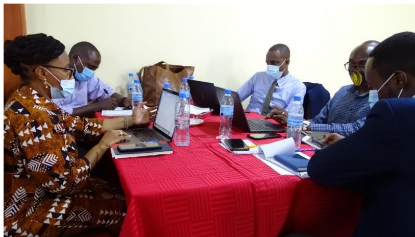
Team of experts developing risk communication and community engagement messages to address COVID-19,, August 2021

In collaboration with the Port health experts, WHO contributed to the development of messages to be strategically positioned at points of entry targeting travelers and long-distance truck drivers. Messages were pretested in select air and seaports before finalization and printing. These messages have been packaged in standalone banners and positioned in various points of entry in the country.