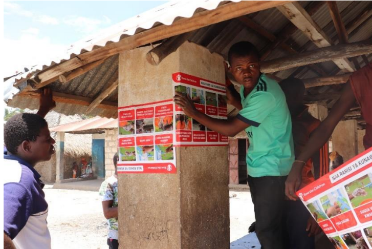
Distribution of public health messages on the response, August 2020