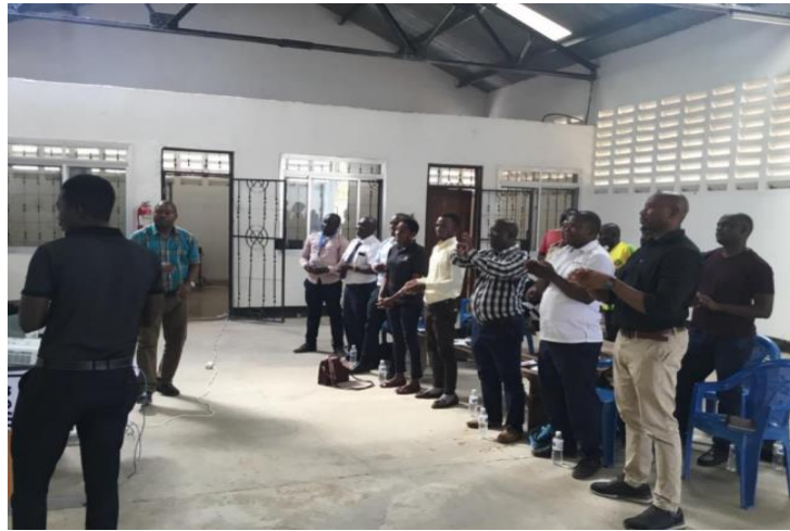
Supervisors and mentees during supportive supervision and mentorship in Songwe Airport November 2020

required for staff to effectively promote, continuity of assessment on population movement and connectivity across the respective borders.