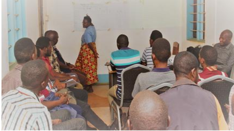
The health information team demonstrating surveillance forms for COVID-19 at Nyarugusu refugee camp, September 2020