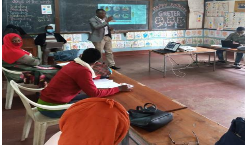
A team of supervisors from WHO, Arusha region, Karatu District Council and facilitation of CHWs in one of the sessions, June 2020