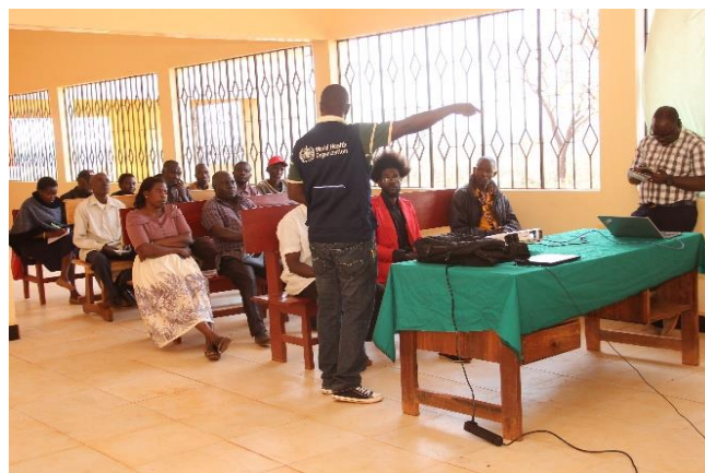
Facilitation session of a community influencers training at Nyamyusi village, July 2020

As these community groups are mostly contacted when a community member gets sick, the groups were capacitated on COVID-19 and Ebola risks and preventive measures. Emphasis was given on their role to report to health authorities if anyone from their clients and the community seems to have signs and symptoms suggestive of COVID-19 or Ebola. Subsequently, the number of epidemic alerts and rumours reported to the region have increased since this capacity building exercise..