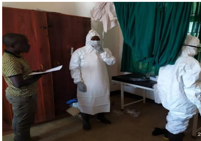
Practical sessions on infectious specimen collection at Kakonko Health Center, July 2020

Following the establishment of community transmission of COVID-19 in Kigoma and the escalation of alerts, WHO in collaboration with Kigoma RHMT built the capacity of 32 laboratory personnel, 4 from each council, on specimen collection, packaging and transportation. These included district laboratory technologists, laboratory managers, laboratory technicians and laboratory attendants for facilities that had no laboratory technicians from all the district councils in the region.