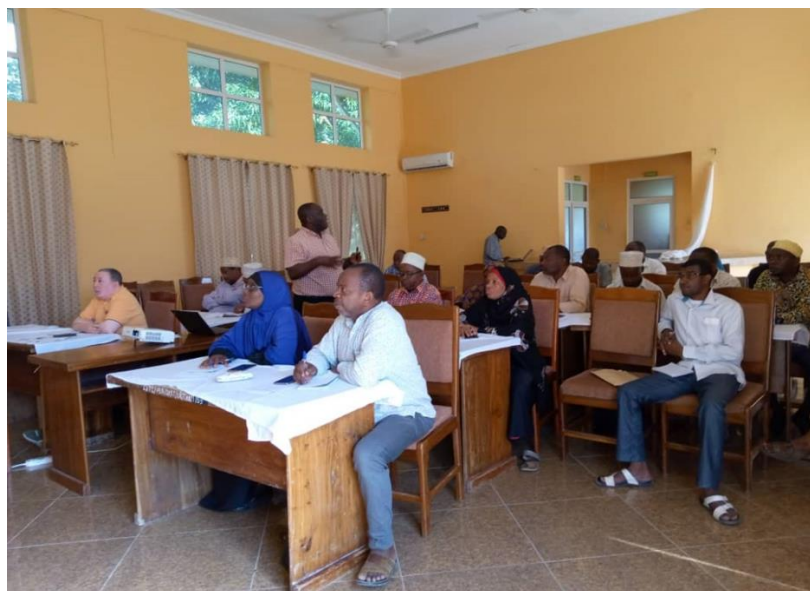
WHO Coordination officer facilitating a session during IMS training, September 2020

In supporting the MOH decentralization of preparedness and response activities, WHO participated and facilitated IMS training at the district level, a total of forty-seven participants benefit from the training which was conducted in Unguja at Abila hotel conference hall from 24th – 27th September 2020 and a total of thirty participants were trained from 5th – 8th October 2020. The CDC IMS training package was used to deliver the training.