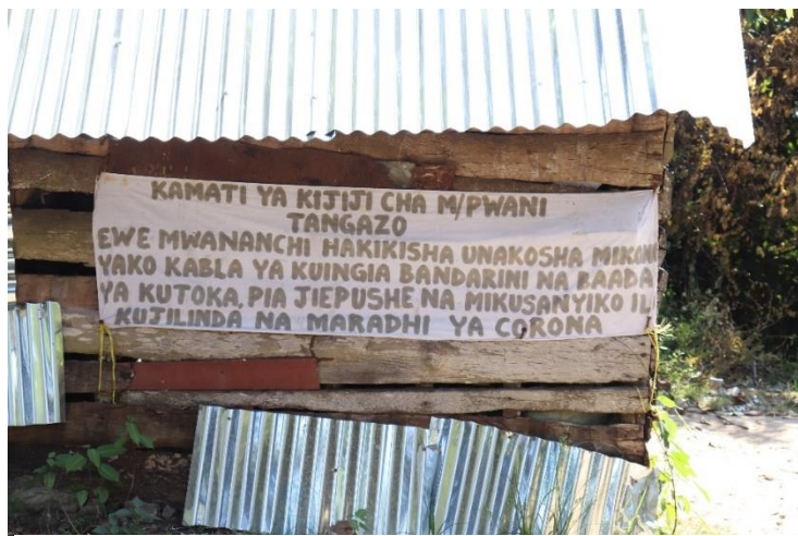
Preventive messages against COVID-19 at Points of Entry, Zanzibar, November 2020

Zanzibar strengthened their surveillance system especially at the point of entries. In developing and implementing this effectively, the Ministry of Health in collaboration with WHO conducted supportive supervision and mentorship at all points of entry in Unguja and Pemba. The aim was to capacitate the PoE staff and strengthen the surveillance system for early detection of public health events which include COVID-19. Observation, interviews and discussion using standardized checklist was used during supervision. Seven points of entries were supervised and mentored; in Pemba these were; Mkoani, Weshu, Wete seaports and Pemba airport. While in Unguja these included; Malindi, Mkokotoni seaports and Amani Abeid Karume International airport. The supervision was conducted in Unguja from 10 th to 13 th November 2020 and Pemba: 22 nd to 27 th November 2020. The checklist focused on the following areas of supervision and mentorship: diseases surveillance, waste management, vector control, Inspection program, occupational health, medical and first aid services, emergency services, health promotion.