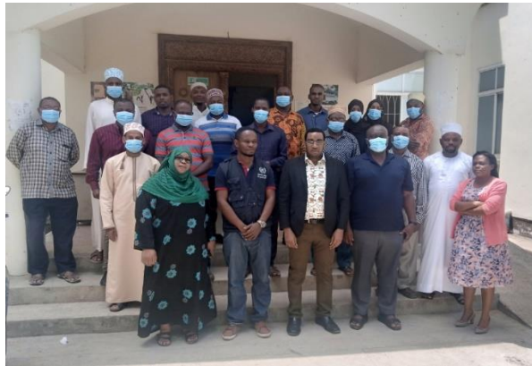
Facilitators and IDSR Zanzibar ToTs August 2020 Guidelines, July 2020

The organization supported the Training of Trainers (ToT) in Zanzibar on the 3rd edition of the IDSR guidelines which was conducted from 24 th to 28 th August 2020. The training was preceded with a facilitators meeting to adapt the training materials and preparation of the training program. The training was attended by 33 surveillance officers from the MOH and all districts in Unguja and Pemba. The ToT were used to cascade the training of new guidelines at the sub-national level in all districts and health facilities. In Pemba a total of 95 health facilities were trained on the new IDSR guidelines and in Unguja 67 community-based surveillance focal persons were trained in two districts (North B and West B). A group of facilitators and participants during the ToT training is observed in the picture on the left.