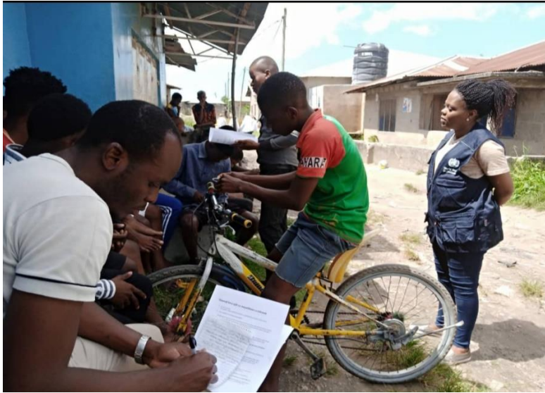
Research team and participants in a Focus Group Discussion (FGD) – youth (men) in urban district, September 2020