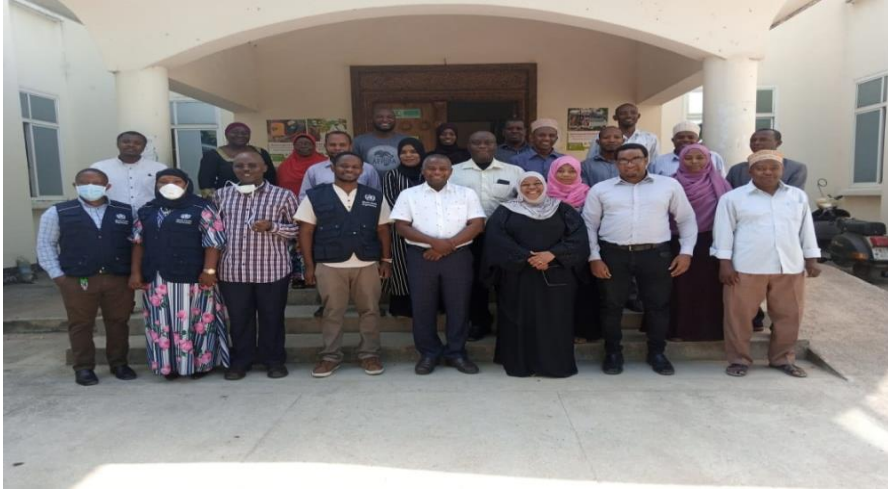
Adaptation task force participated in the adaptation of Zanzibar 3 rd Edition IDSR Guidelines, July 2020