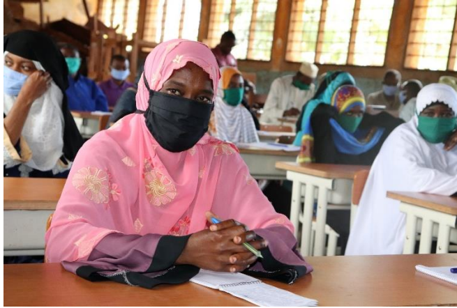
Orientation of community health workers on case- based surveillance, October 2020, Zanzibar