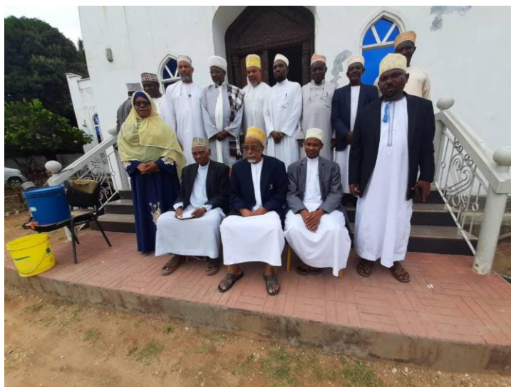
Promoting public health messages on the response - influential Imams and Sheikhs; Priests and Pastors, August 2020

WHO facilitated dialogues between the RCCE team and Islamic leaders in Zanzibar through a series of meetings under the leadership of the Zanzibar's Mufti. Five (5) meetings were organized involving 21 influential Imams and Sheikhs; Priests and Pastors. In all the sessions, the faith leaders were oriented on the COVID-19 safety precautions and how they can play a role in promoting these measures in the places of worship. As a result of this engagement, compliance to safety precautions was observed in churches and mosques for several months.