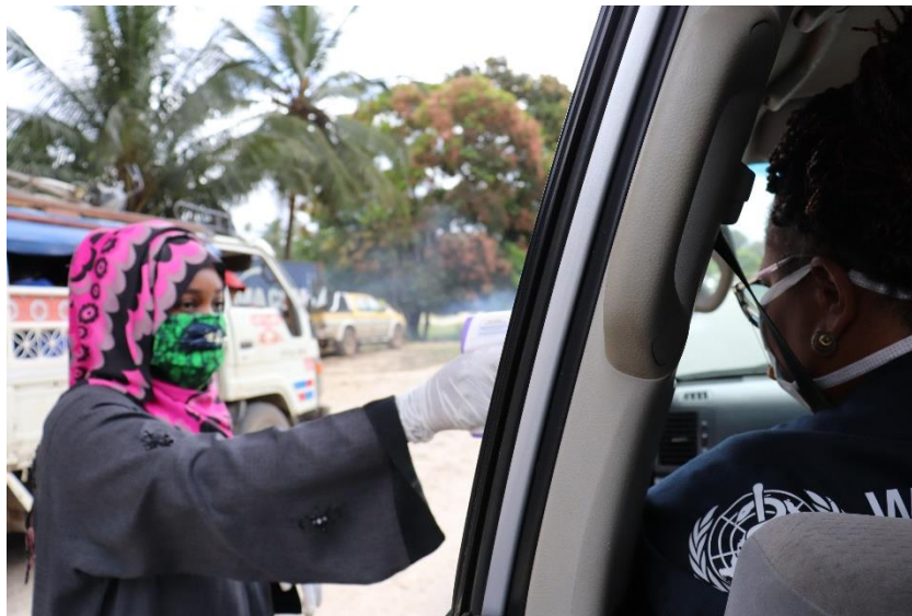
Screening at Point of Entry in Katavi, November 2020

Among the challenges identified were; inadequate port health staff where only 48% are currently available, inadequate capacity of port health staff in HID prevention skills, inadequate disinfecting materials (chlorine and sanitizers) at most POEs (chlorine was mentioned to be available at only 1 out of 6 POEs), difficulties in practicing temporary isolation due to the absence of temporary or permanent structure, frequently changing travel advisory guidance for entry and exit screening and inadequate PPEs in all the POEs visited.