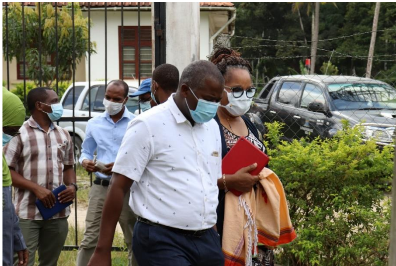
Discussions of public health experts on the response, August 2020

the assessment and discussion with team prior to the training. The supportive supervision visit was used as an opportunity to orient RHMTs and CHMTs on the just finalized National Response Plan. Half-day session was carried out with the 9 RHMTs and 9 CHMTs members highlighting the key components of the plan. It was agreed that RHMT will cascade orientation to the remaining districts with the aim of reviewing and updating their own regional and district plans. The training, mentorship and supportive supervision was an integrated activity with a focus on building capacity of the front-line health care workers in critical and general management of COVID-19 and mitigating gaps that were identified from previous mentorship programs.