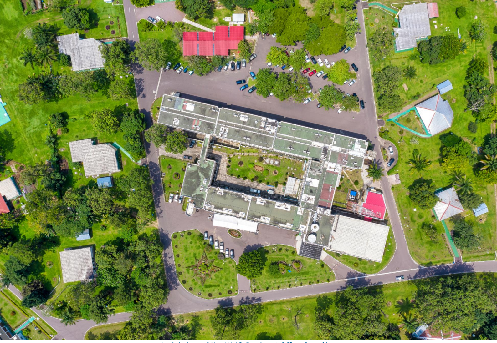
Aerial view of the WHO Regional Office for Africa