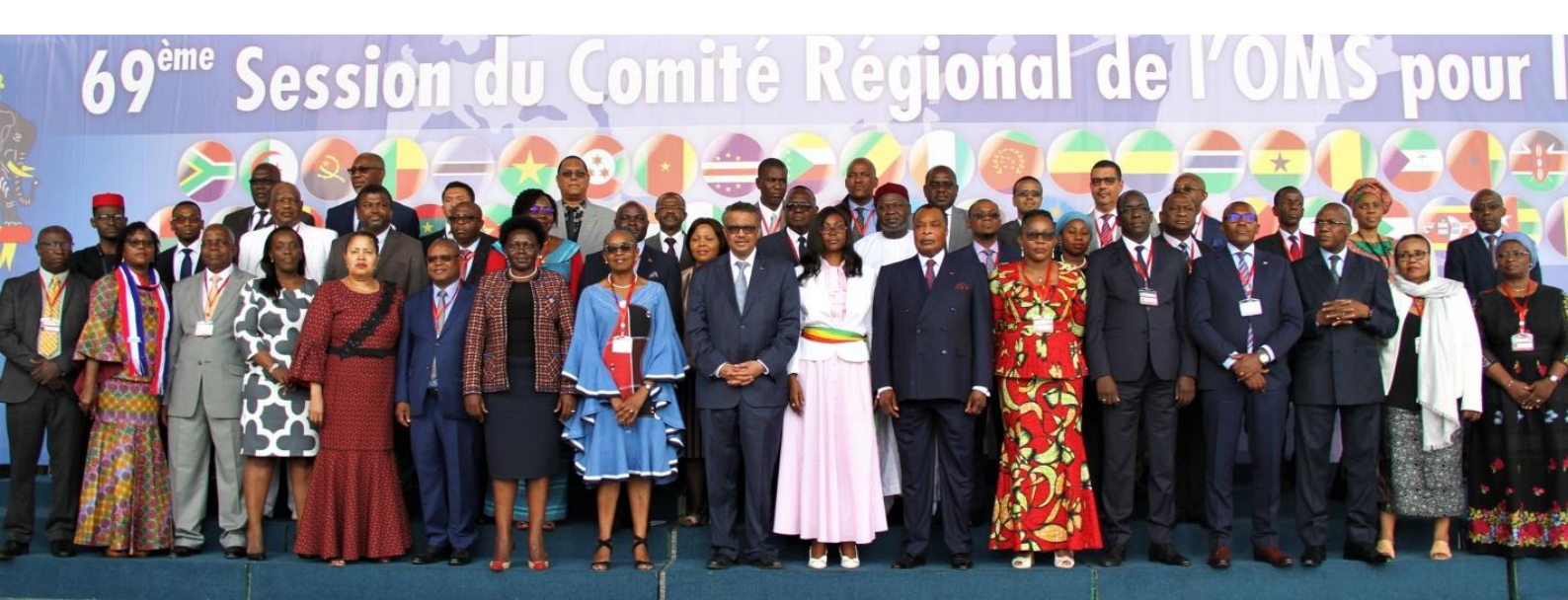
Group photograph taken shortly after the opening ceremony