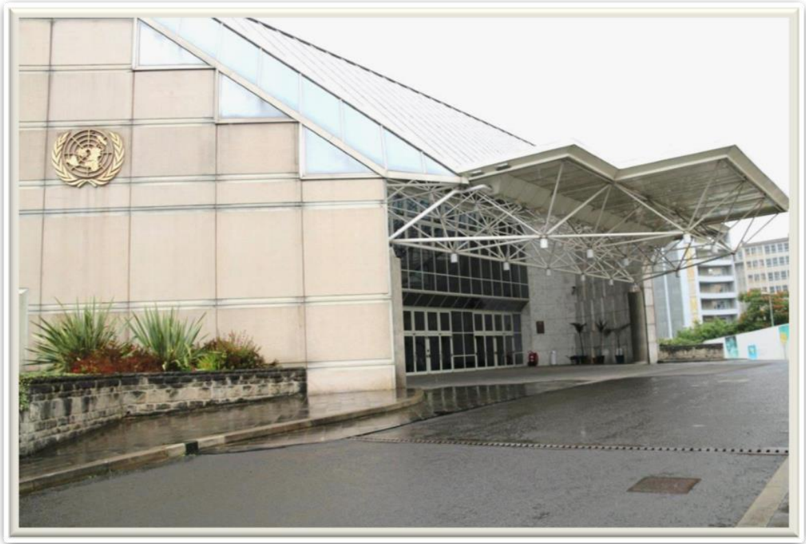
Front view of the United Nations Conference Centre