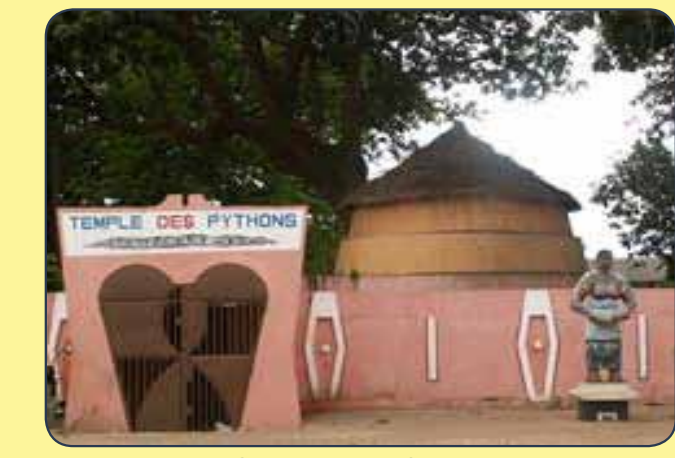
Ouidah Temple of the Python