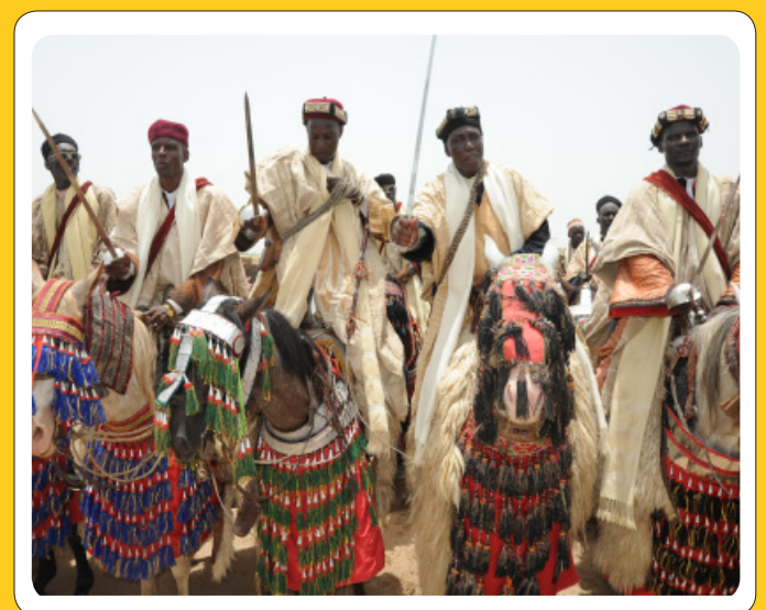
Horsemen from Kanem region of Chad