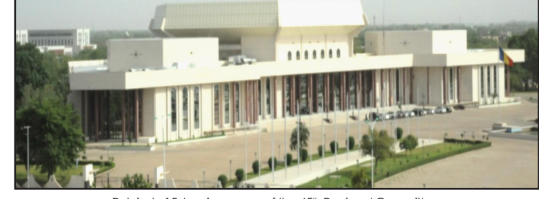
Palais du 15 Janvier, venue of the 65th Regional Committee