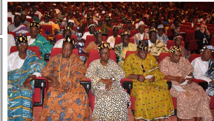
Traditional leaders from Yamoussoukro at the opening ceremony - RC61