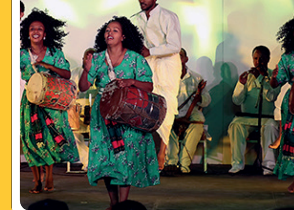
A cultural dance from Ethiopia